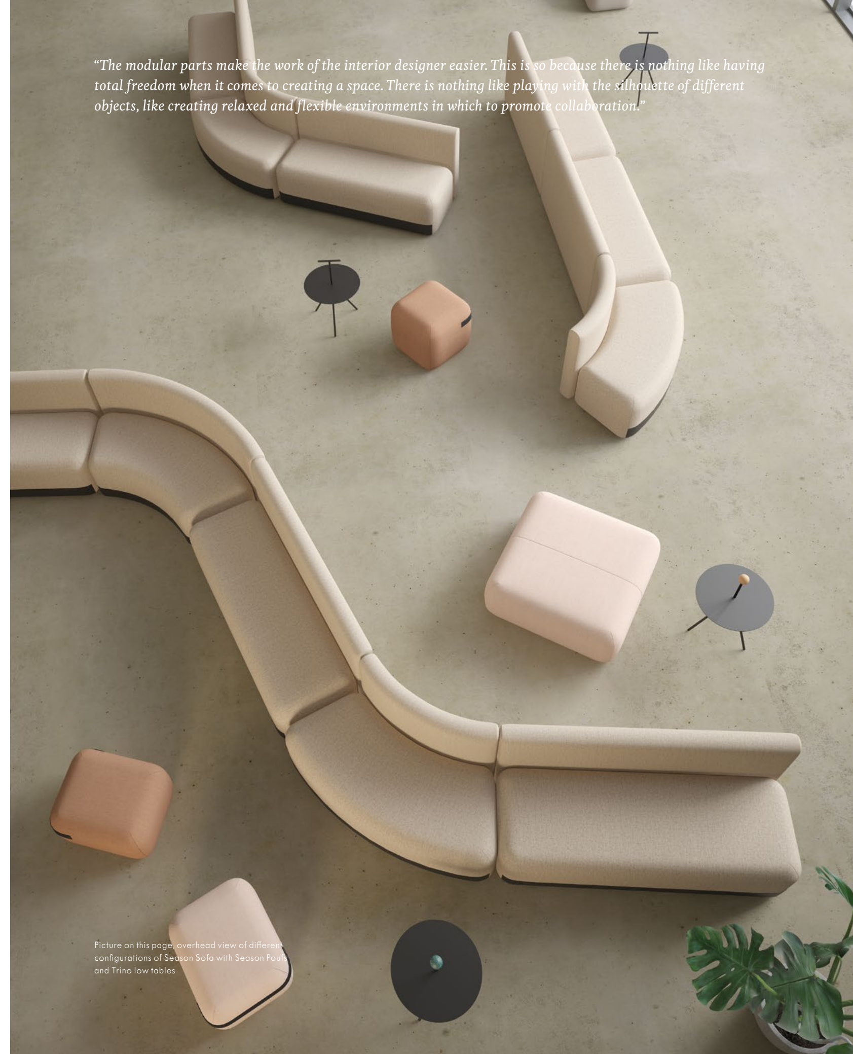
Picture on this page, overhead view of different configurations of Season Sofa with Season Poufs and Trino low tables

“The modular parts make the work of the interior designer easier. This is so because there is nothing like having total freedom when it comes to creating a space. There is nothing like playing with the silhouette of different objects, like creating relaxed and flexible environments in which to promote collaboration.”