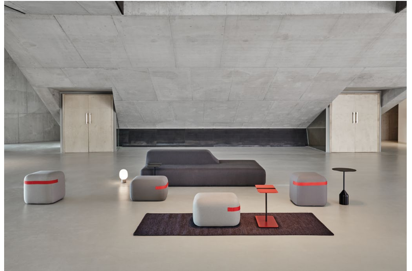
On the left, Season bench.