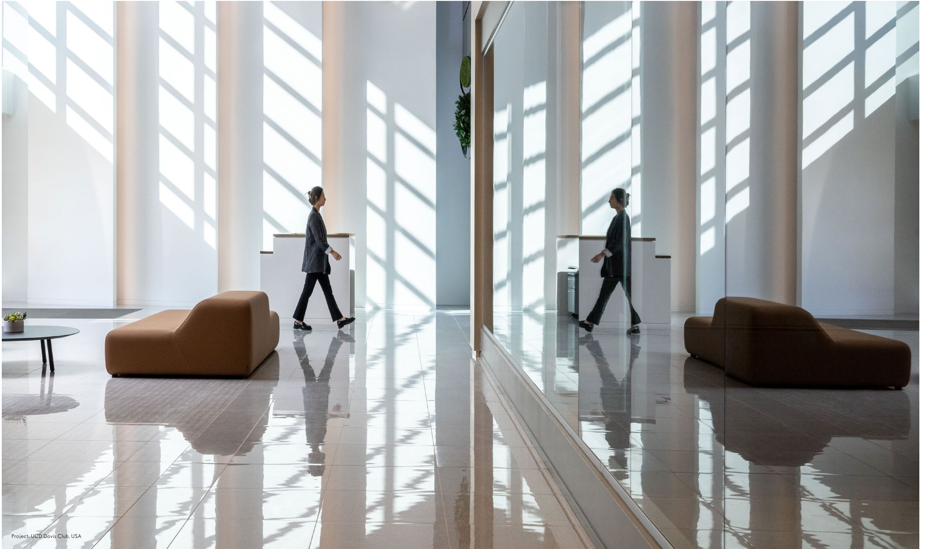
Project: UCD Davis Club, USA