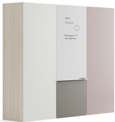
Whiteboard*, Melamine, Fabric