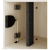
Cable Duct (vertical cable management for networked cabled locks)

**Options available only for units equipped with door.