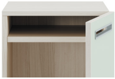
Fixed Mail Shelf** (available for locker units 400mm or higher)