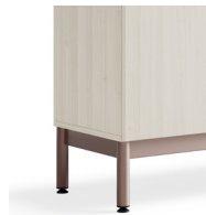
220mm Frame Base with Cable Tray*

*Compatible with cabled networked locks.